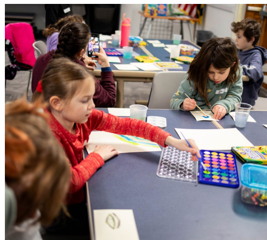
Kids' Academy: Portraiture