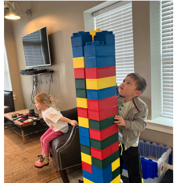
Preschool Block Party

Learn about Cecil County Animal Services, make a pet toy to donate to the shelter, and meet some friendly pets! For families with children ages 5-14.