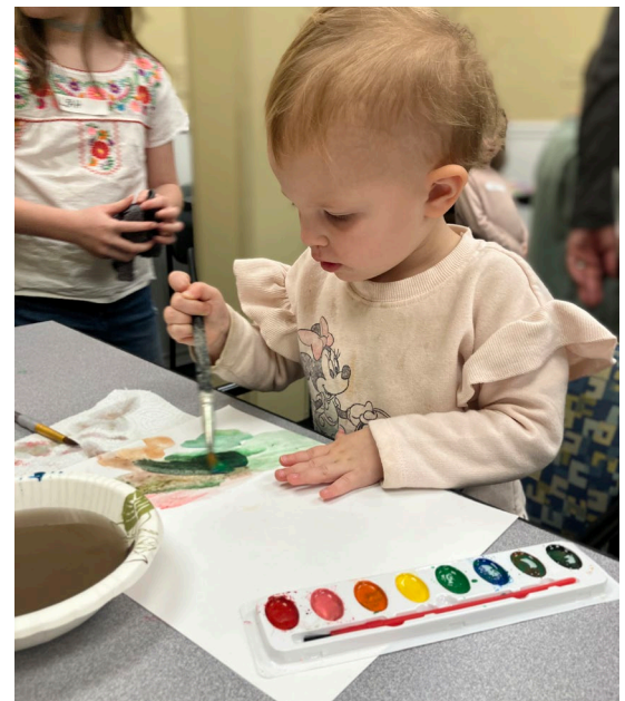
Abstract Art for Kids