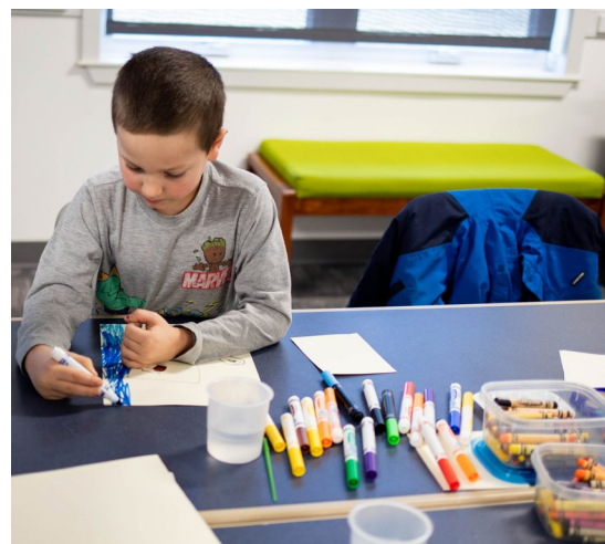
Kids' Academy: Portraiture

Unleash your creativity and transform ordinary found objects into unique and stunning wearable art pieces.