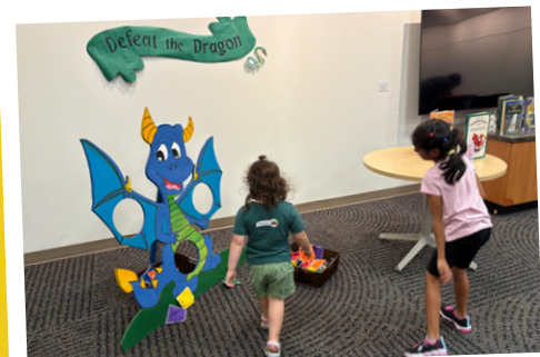
Once Upon a StoryTime

Discover how contaminants, such as oil, affect the overall composition and structure of feathers, and explore how the Tri-State's Oiled Wildlife Response Team helps save animals effected by oil spills. Ages 9-14.