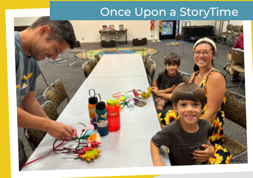
Once Upon a StoryTime

Register at any branch or online: www.cecilcountylibrary.org